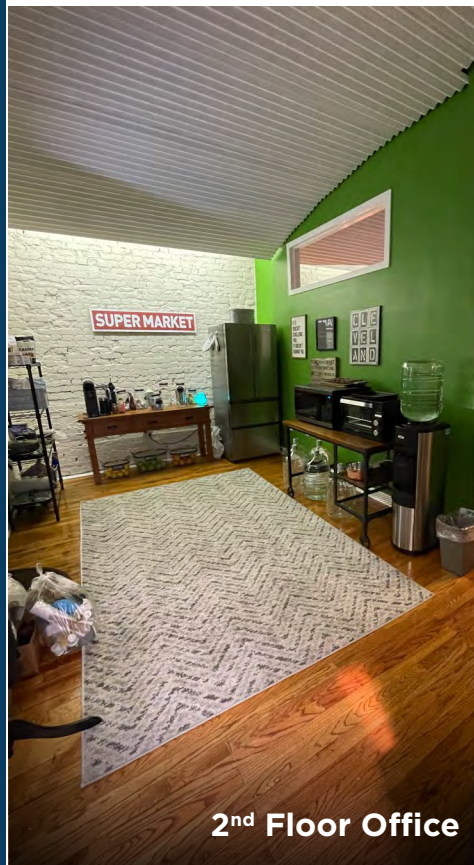
2nd Floor Office