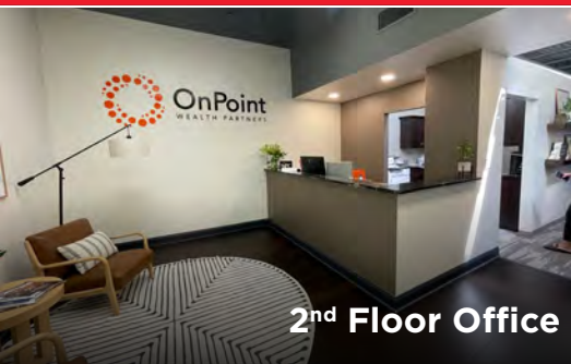
2 nd Floor Office