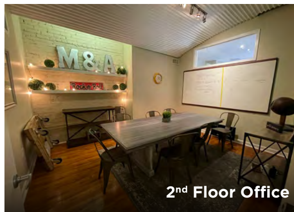
2nd Floor Office