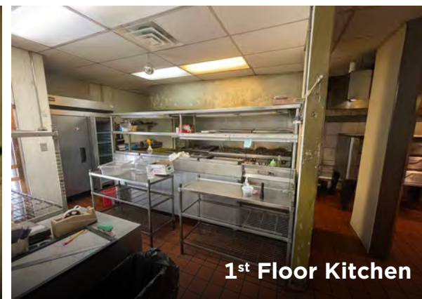
1st Floor Kitchen