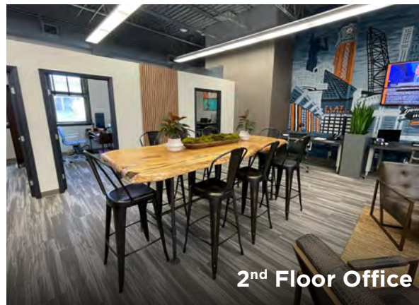
2nd Floor Office