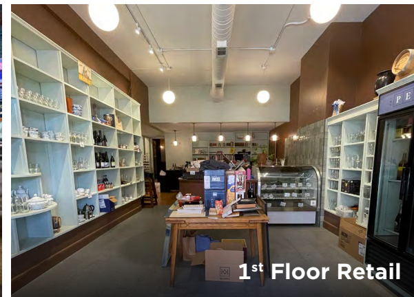
1st Floor Retail