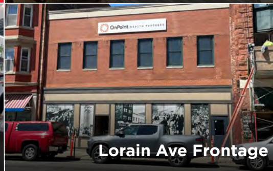
Lorain Ave Frontage