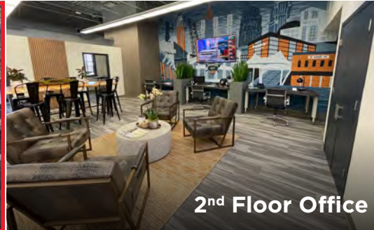
2 nd Floor Office