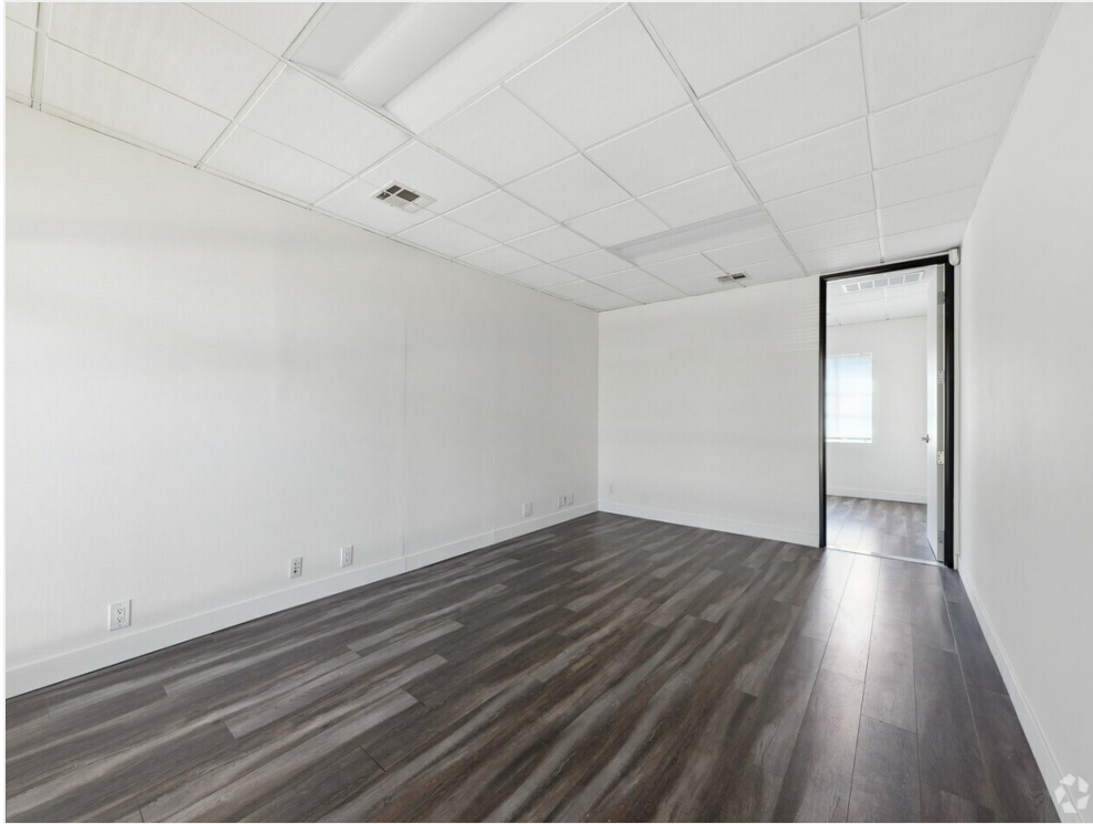
203 B 1512