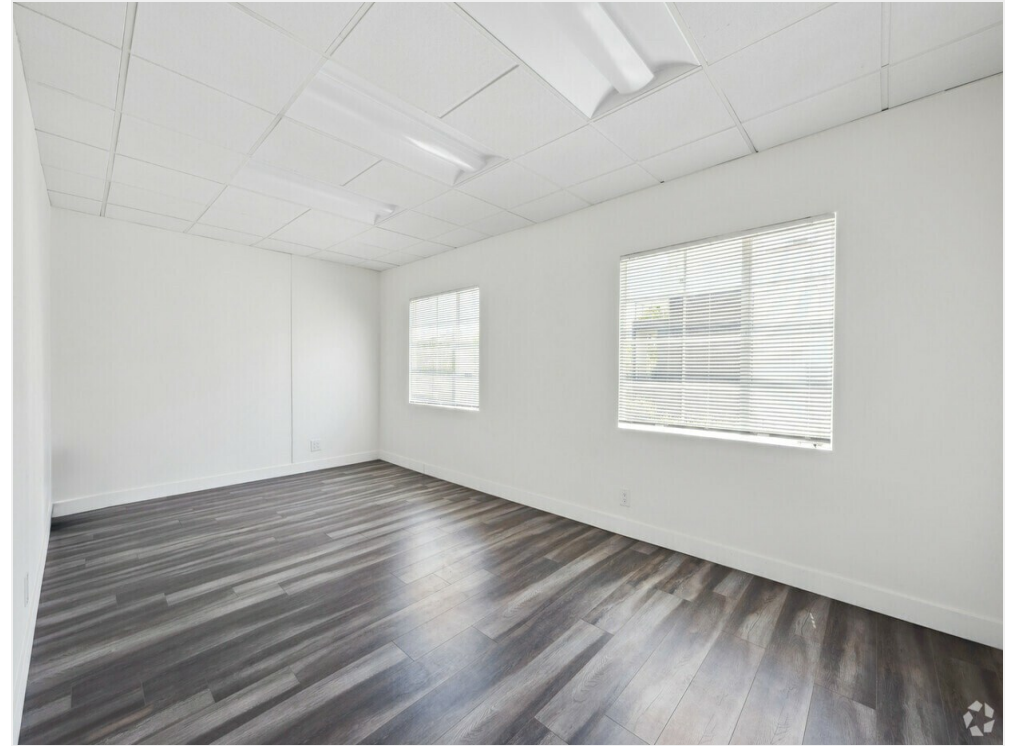
203 A 1512