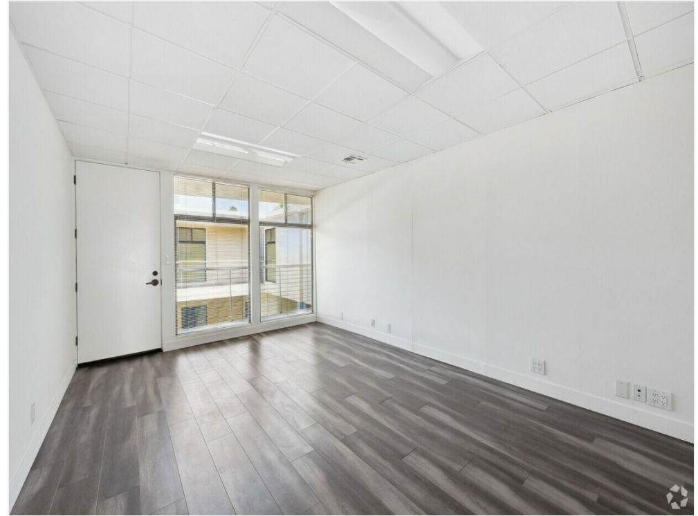
203 C 1512