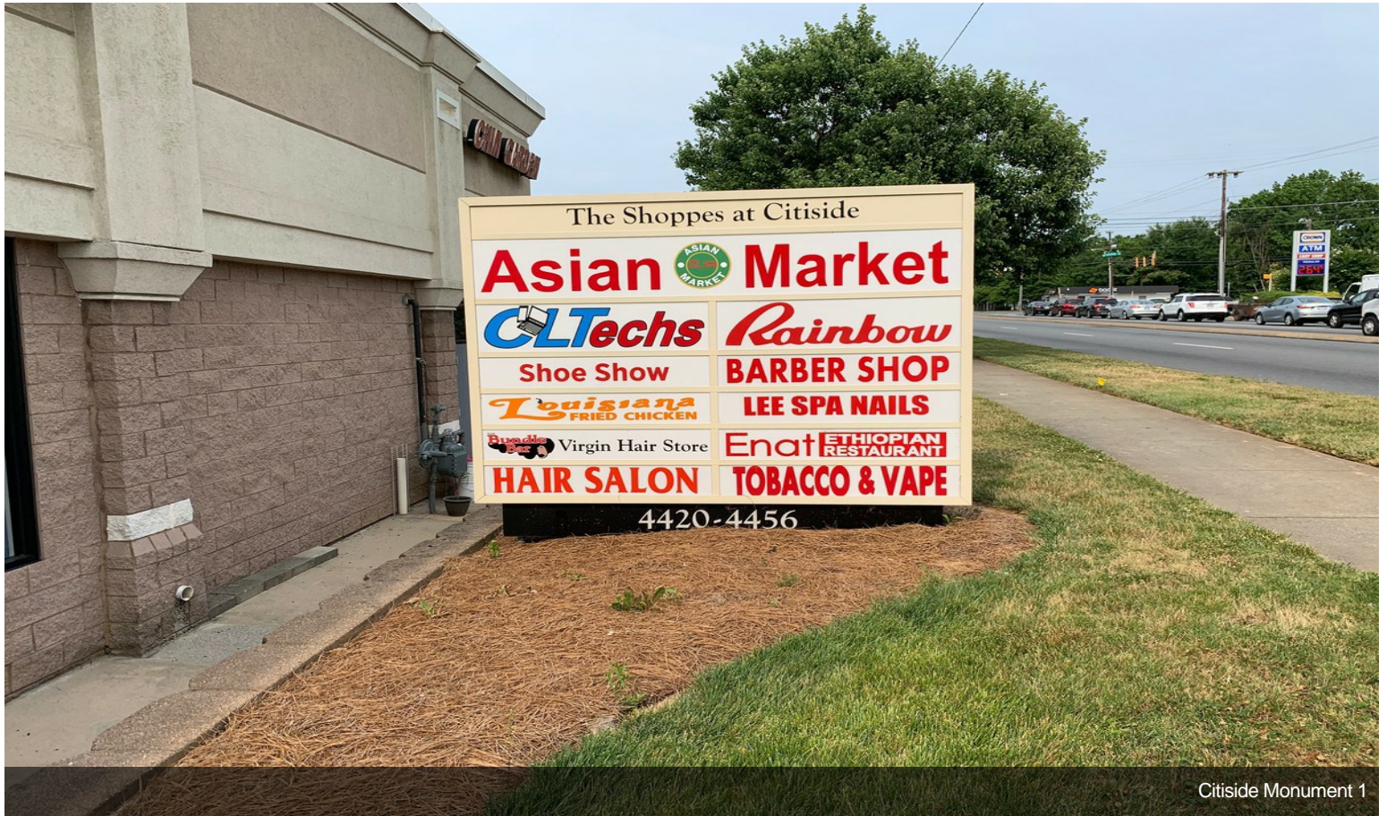
Citiside Monument 1