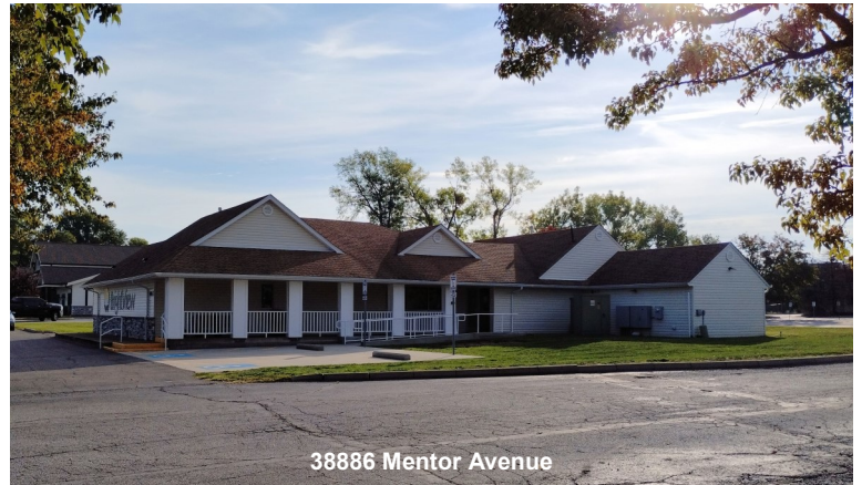
38886 Mentor Avenue