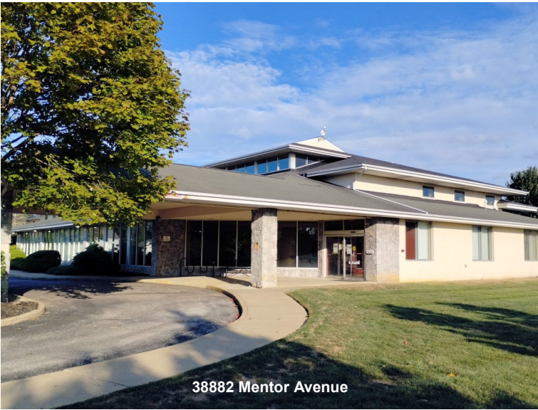
38882 Mentor Avenue

38882 - 38886 Mentor Avenue Willoughby, OH 44094