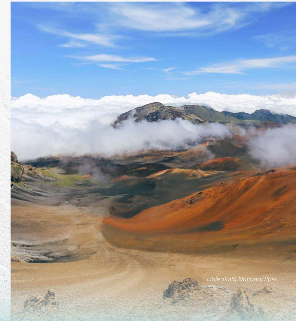
Haleakalā National Park

Maui offers the potential for significant returns, given the island's popularity as a tourist destination and its commitment to sustainable growth. The combination of natural beauty, cultural richness, and a forward-thinking approach to tourism makes Maui an attractive location for real estate investment.