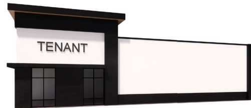
SIDE ELEVATION - EAST