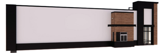
SIDE ELEVATION - WEST

MITCH HOHLEN mitch@woodsonia.net M: [402] 326-1033