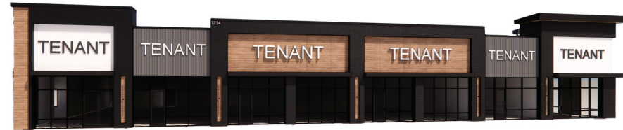
FRONT ELEVATION - SOUTH