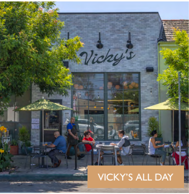
VICKY'S ALL DAY