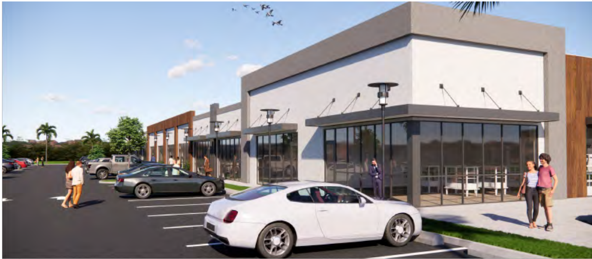
Approved Retail Plan