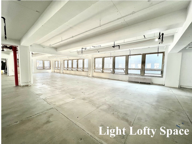
Light Lofty Space