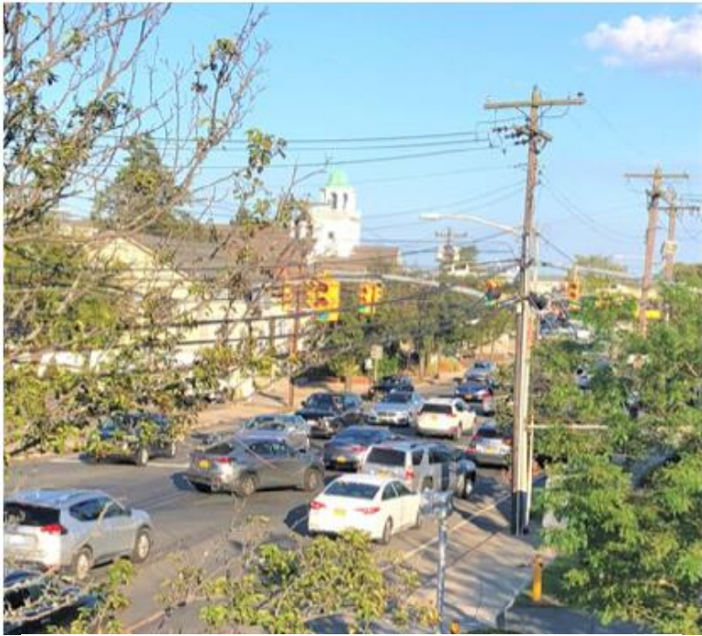
Window View of Busy Intersection