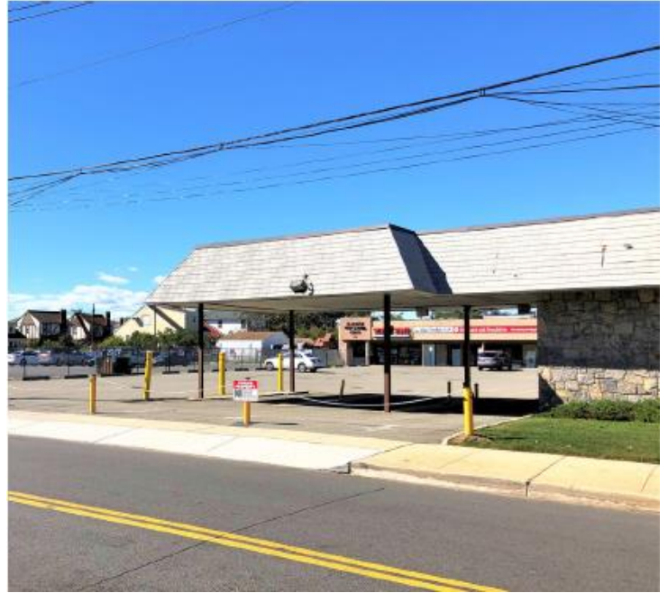
Sheltered Drive-Thru & Parking