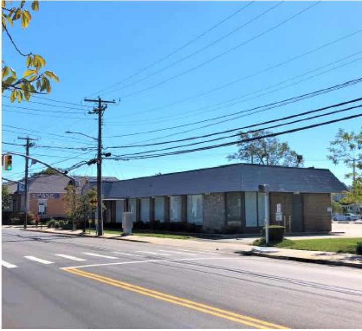
From Main Street Intersection