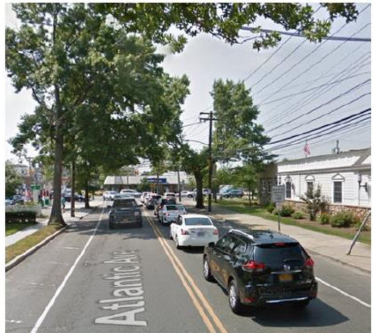
Traffic View on Atlantic Ave (Main St)