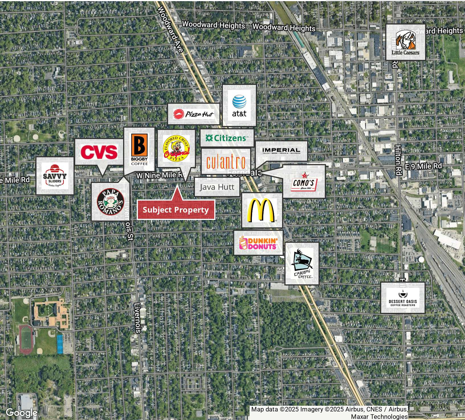
Map data ©2025 Imagery ©2025 Airbus, CNES / Airbus, Maxar Technologies