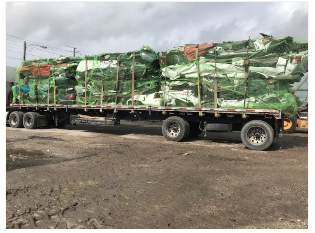
CRUSHER AND FRONT END LOADER