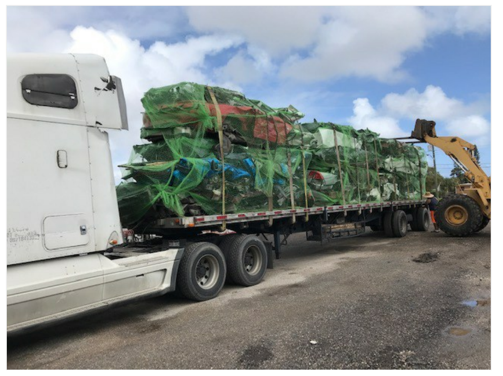
CAR CRUSHER AND FRONTEND LOADER