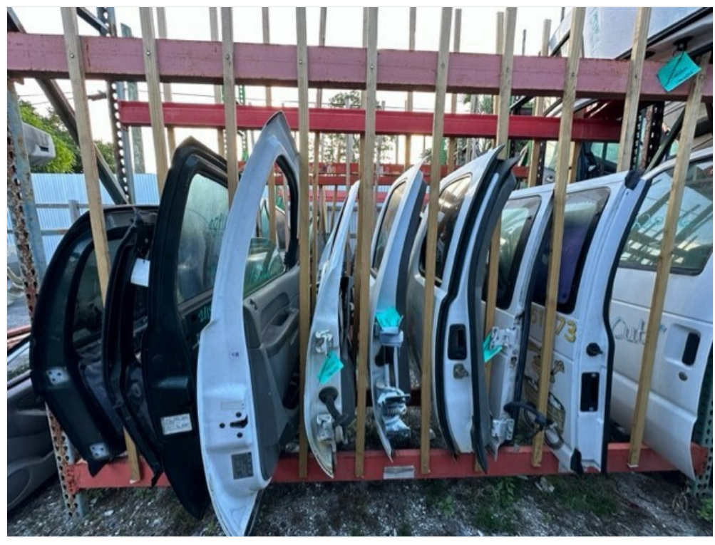
PALLET RACKING INVENTORY