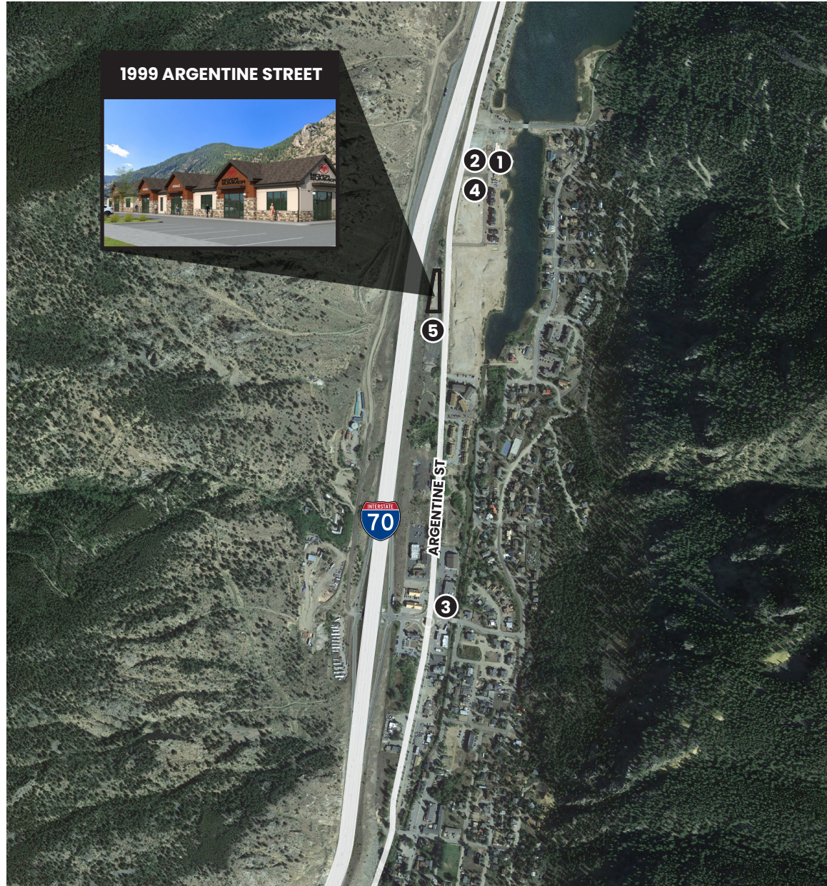
1999 ARGENTINE STREET