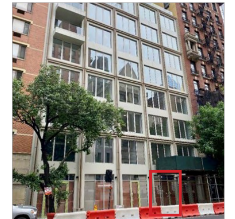
165 LEXINGTON AVENUE, 3