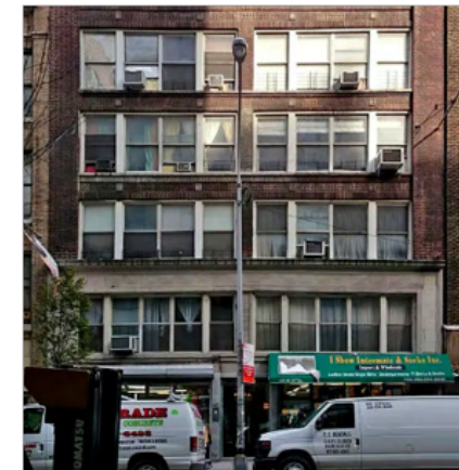
145 WEST 27TH STREET