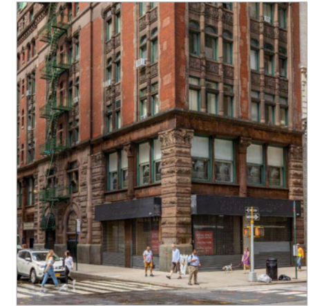
284 FIFTH AVENUE