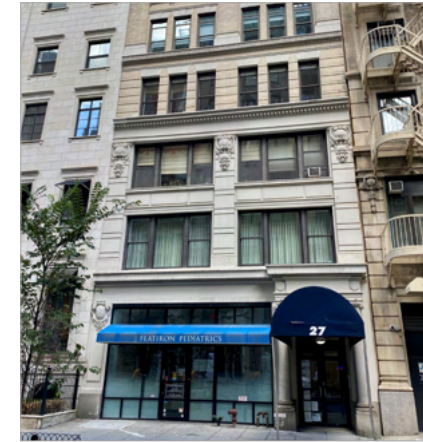
27 EAST 22ND STREET