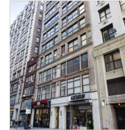
35 WEST 36TH STREET