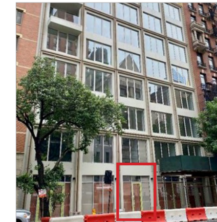
165 LEXINGTON AVENUE, 2