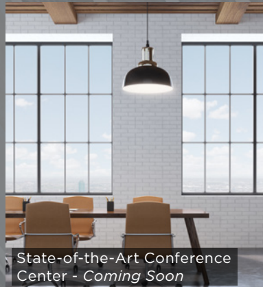
State-of-the-Art Conference Center - Coming Soon