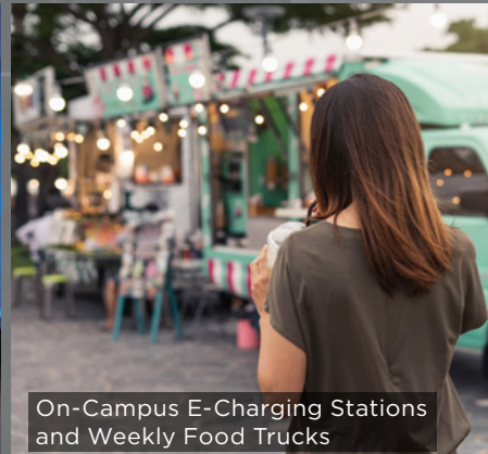
On-Campus E-Charging Stations and Weekly Food Trucks