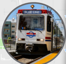
TRAX CRESCENT VIEW STATION