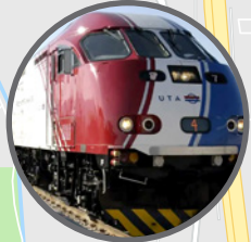
FRONT-RUNNER SOUTH JORDAN STATION