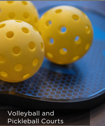
Volleyball and Pickleball Courts