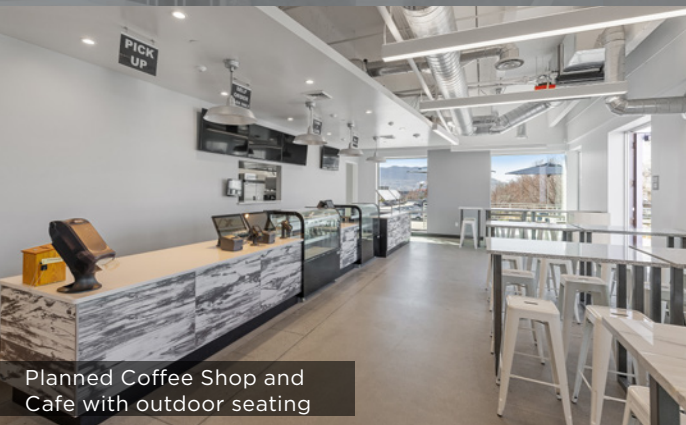
Planned Coffee Shop and Cafe with outdoor seating