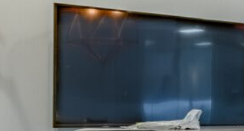
Actual Available Space -10th Floor