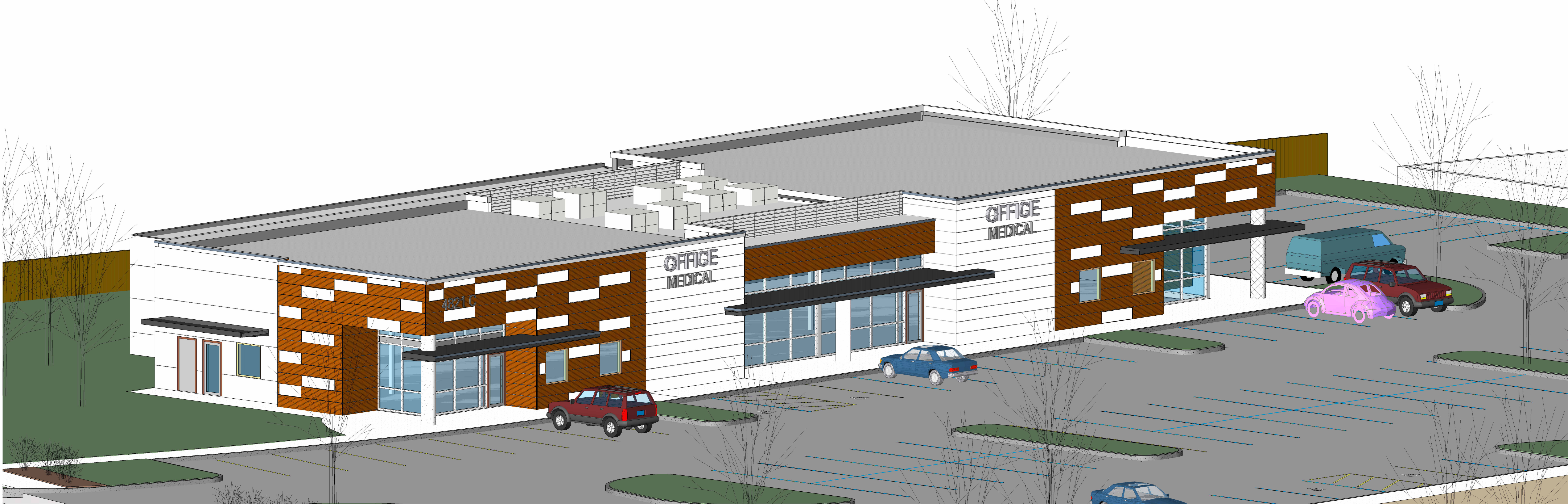
2 AERIAL VIEW FROM CORNER - BLDG C