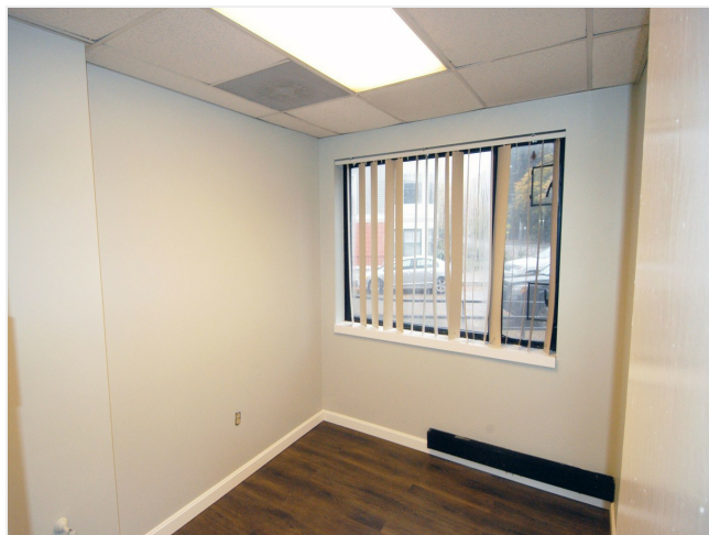
Exam or Small Office