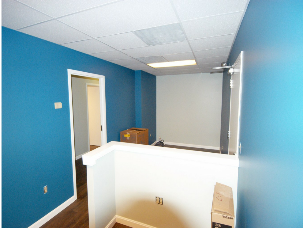
waiting area and reception