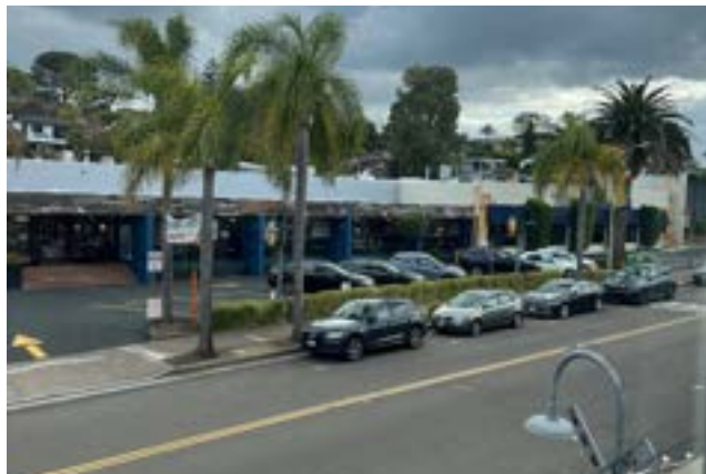
VIEW FROM SUITE