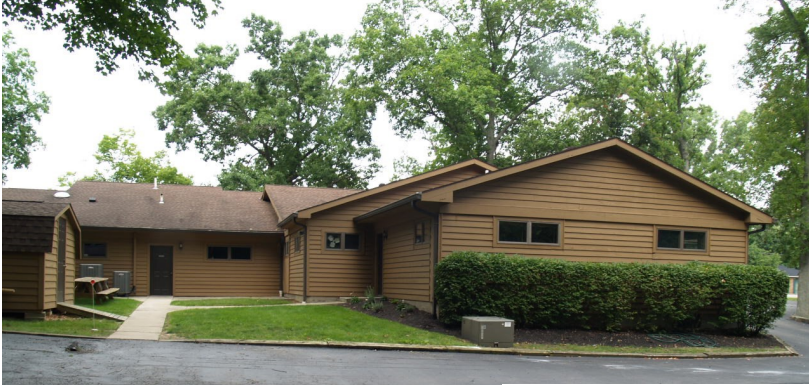
1450 Hanes Rd. Suite C