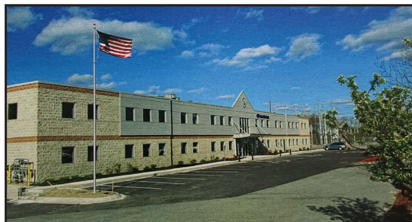
147 Pelham St. Methuen, Massachusetts