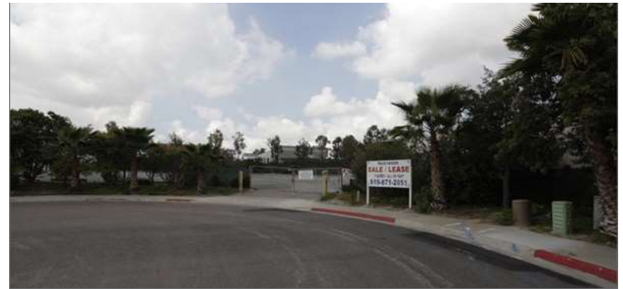
BORDER PACIFIC DR, SAN DIEGO, CA 92154

Sale Date: 10.05.2018 Sale Price : $1,366,427 Lot Size: 2.13 AC Price/Acre: $641,515.02 Lot SF: 92,782 SF Lot PPSF: $14.73 APN: 646-300-09