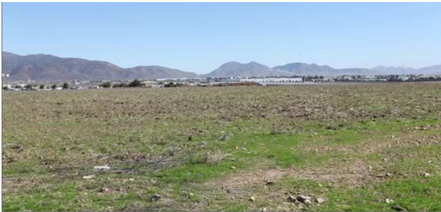
SIEMPRE VIVA RD., SAN DIEGO, CA 92154

Sale Date: 10.05.2018 Sale Price : $1,366,427 Lot Size: 2.13 AC Price/Acre: $641,515.02 Lot SF: 92,782 SF Lot PPSF: $14.73 APN: 646-300-09