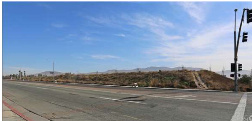
ENRICO FERMI PL, PARCEL 4, SAN DIEGO, CA 92154

Sale Date: 06/12/2018 Sale Price : $6,653,000 Lot Size: 10.82 AC Price/Acre: $614,879.85 SF: 471,319 SF Price/SF: $14.12 APN: 646-112-04-