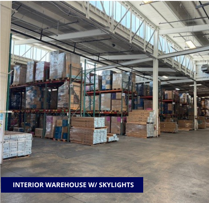
INTERIOR WAREHOUSE W/ SKYLIGHTS