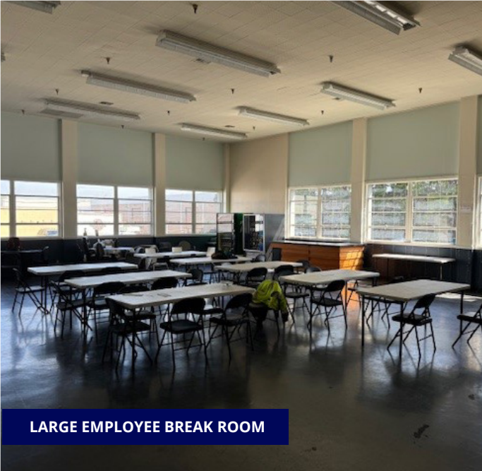
LARGE EMPLOYEE BREAK ROOM