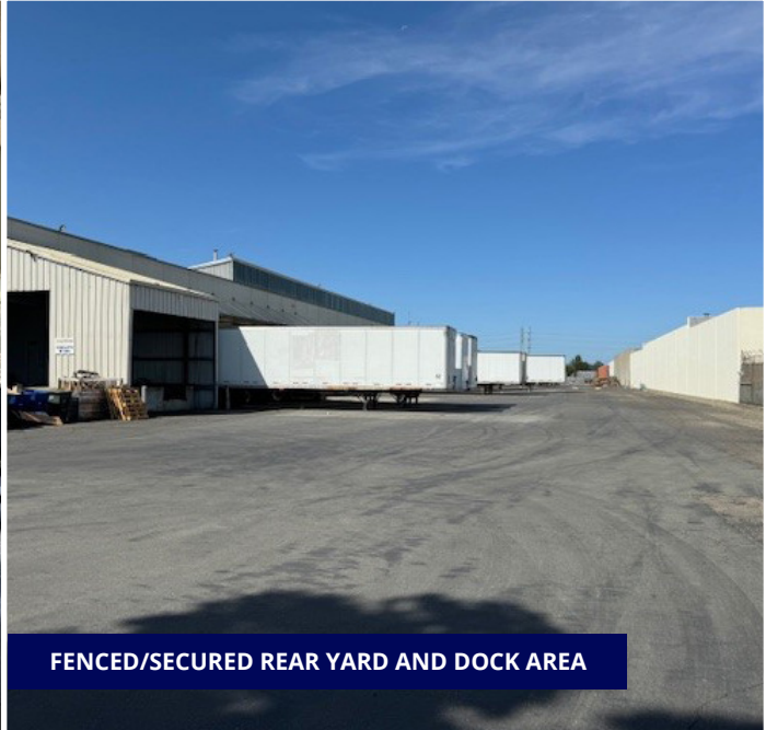
FENCED/SECURED REAR YARD AND DOCK AREA