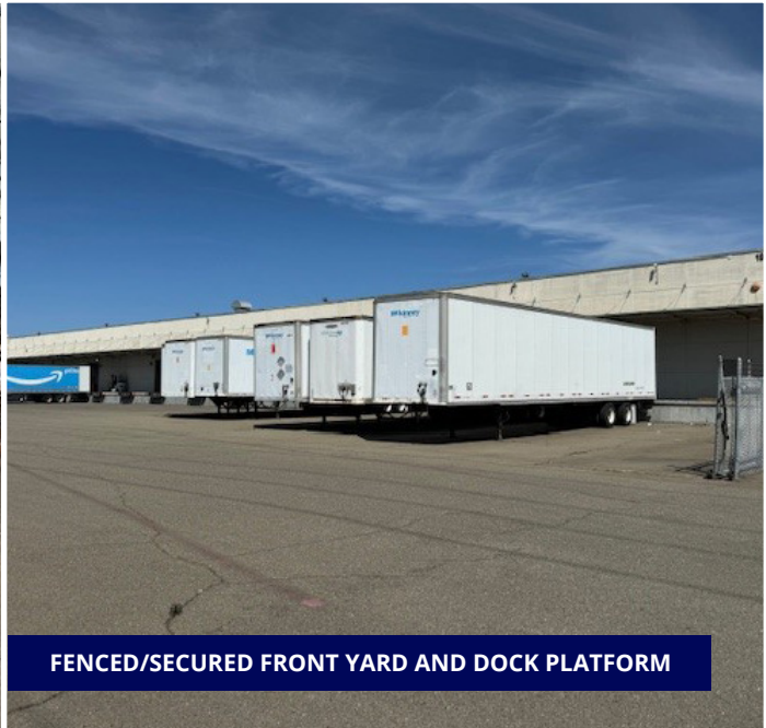
FENCED/SECURED FRONT YARD AND DOCK PLATFORM

This document/email has been prepared by Colliers for advertising and general information only. Colliers makes no guarantees, representations or warranties of any kind, expressed or implied, regarding the information including, but not limited to, warranties of content, accuracy and reliability. Any interested party should undertake their own inquiries as to the accuracy of the information. Colliers excludes unequivocally all inferred or implied terms, conditions and warranties arising out of this document and excludes all liability for loss and damages arising therefrom. This publication is the copyrighted property of Colliers and /or its licensor(s). © 2024. All rights reserved. This communication is not intended to cause or induce breach of an existing listing agreement. Colliers International.