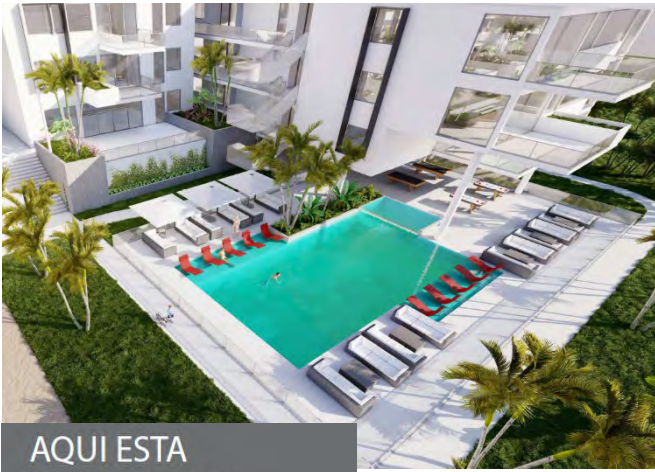
AQUI ESTA Pool Perspective