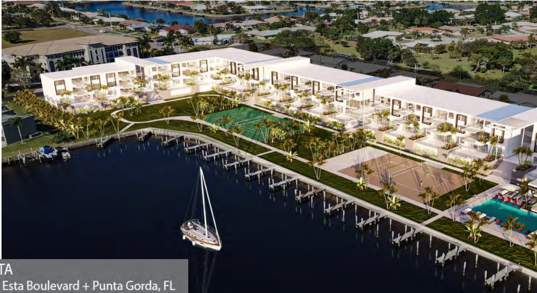
AQUI ESTA 1323 Aquí Esta Boulevard + Punta Gorda, FL