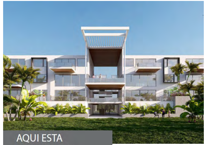
AQUI ESTA South Elevation