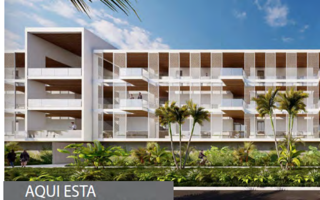
AQUI ESTA Enlarged North Elevation