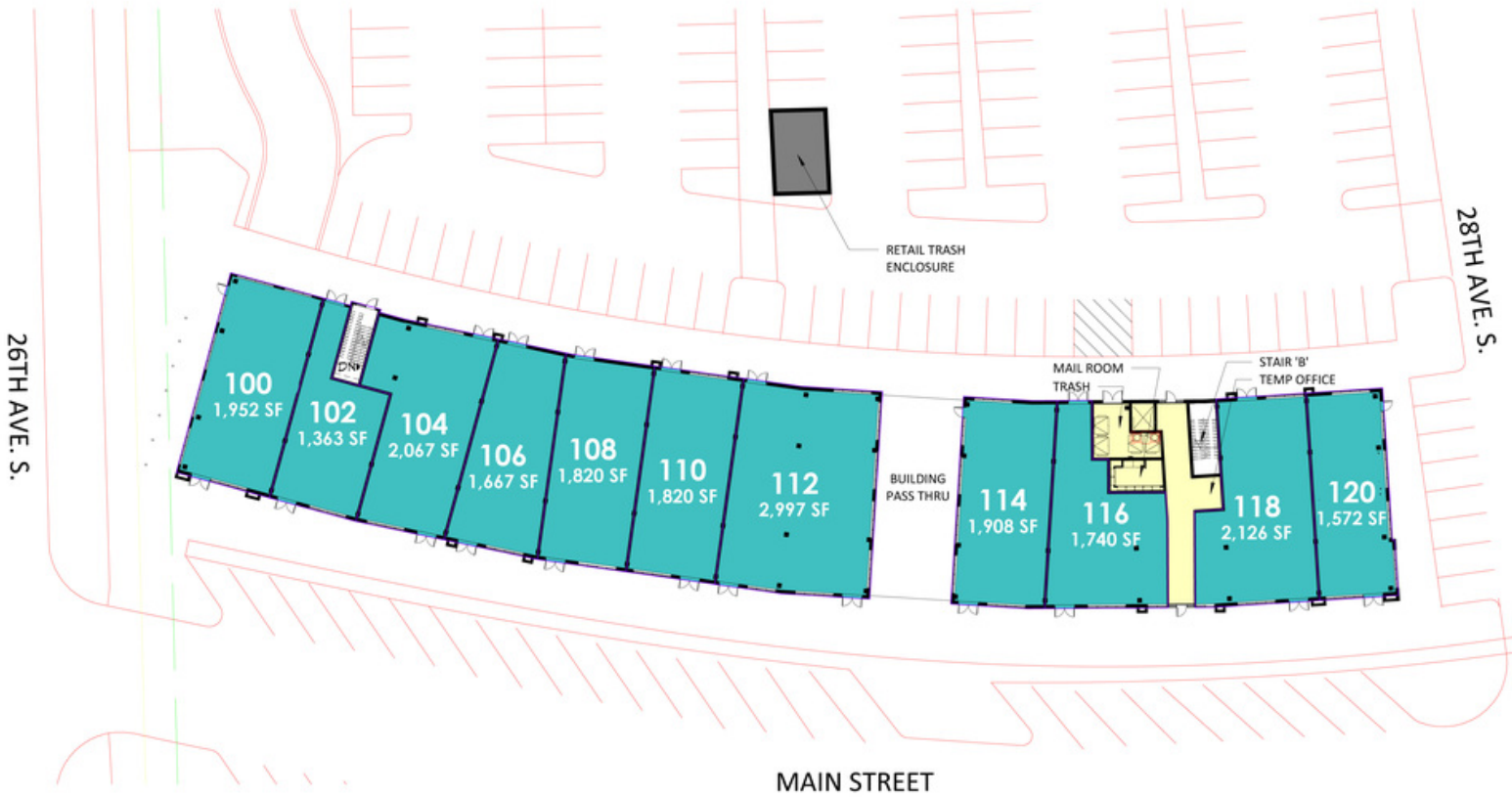
2 FIRST LEVEL FLOOR PLAN MP1.1 1" = 30'-0"