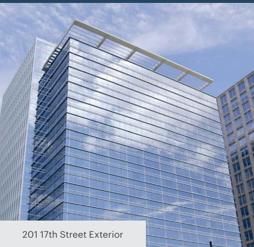
201 17th Street Exterior

+ Visit www.atlanticstation.com for a schedule of upcoming events and additional information