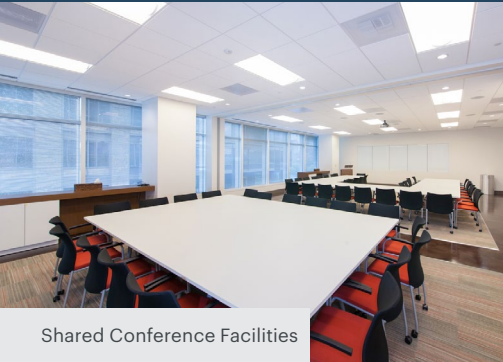
Shared Conference Facilities