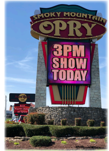
Opry Theater Sign