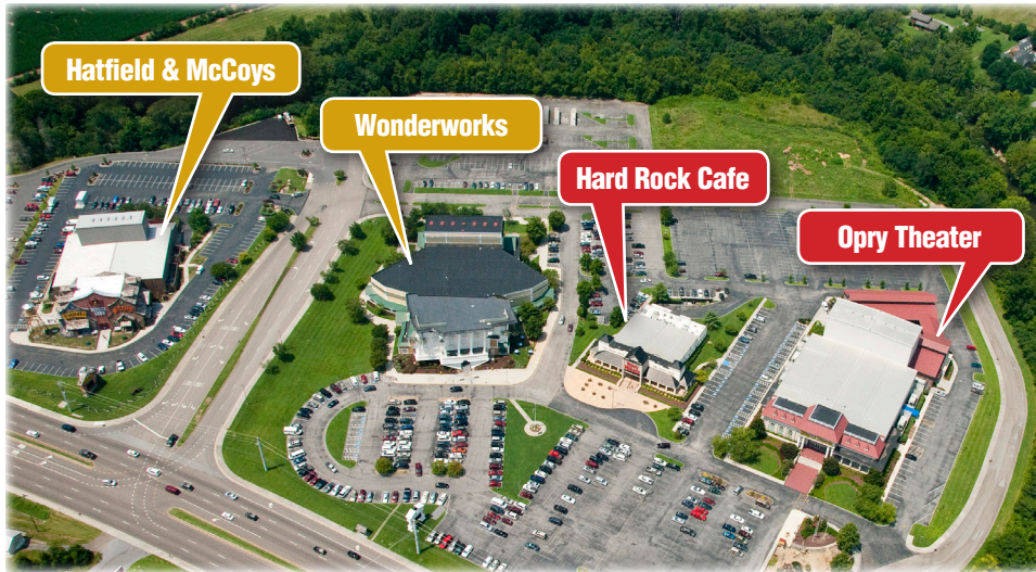
Aerial View of Music Road, Opry Theater, and Surrounding Attractions