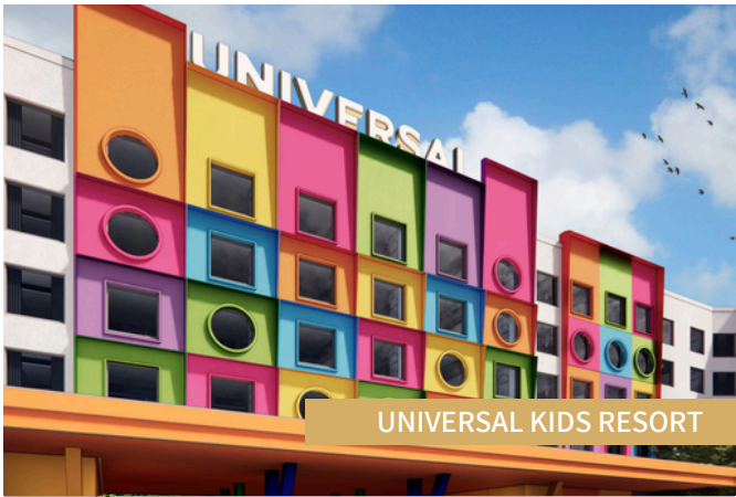
UNIVERSAL KIDS RESORT