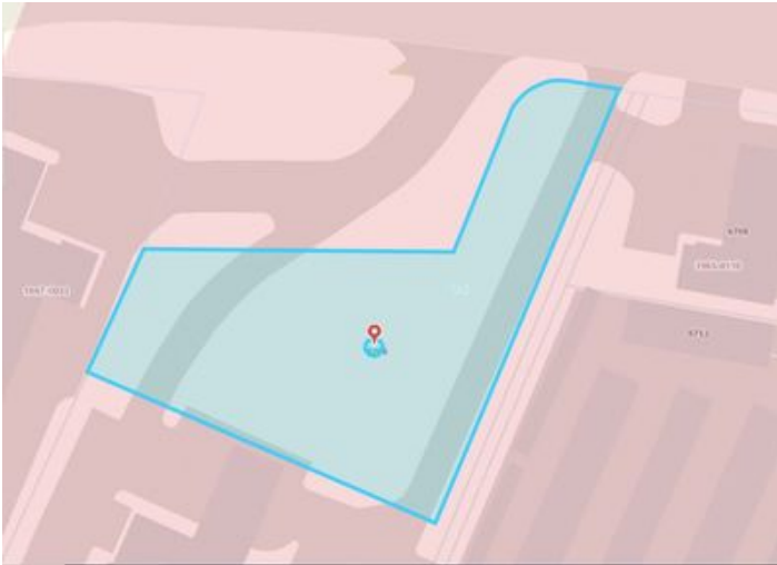
6704 Ringgold, Zone Map