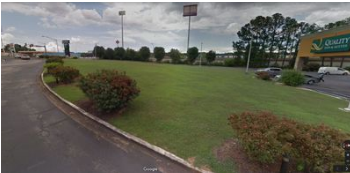
6704 Ringgold, site, photo 2