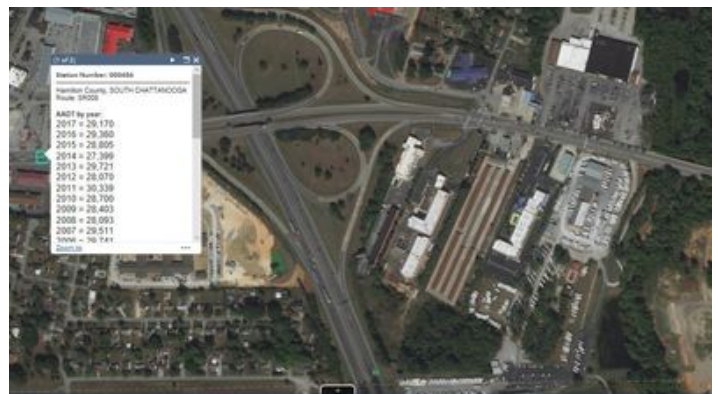
6704 Ringgold, traffic, west of i-75