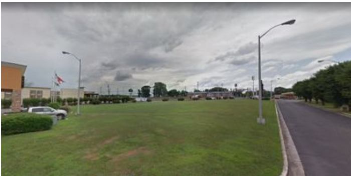
6704 Ringgold, site, photo 3