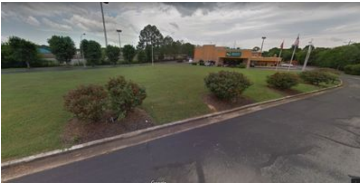
6704 Ringgold, site, photo 1