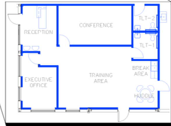
② ENLARGED OFFICE FLOORPLAN 1/8" = 1'-0" 1,080 SF