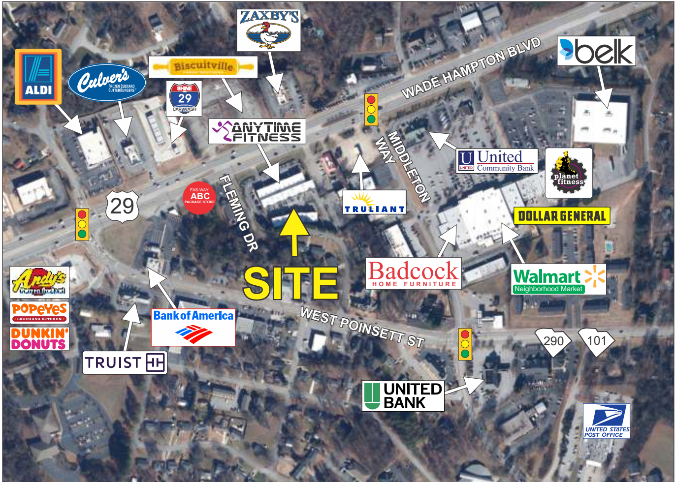
ACCESS FROM WADE HAMPTON BLVD. (HWY 29) OR FLEMING DRIVE