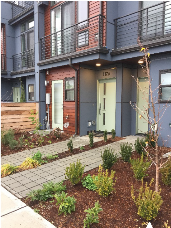
FIGURE 533-3 HORIZONTAL SEPARATION