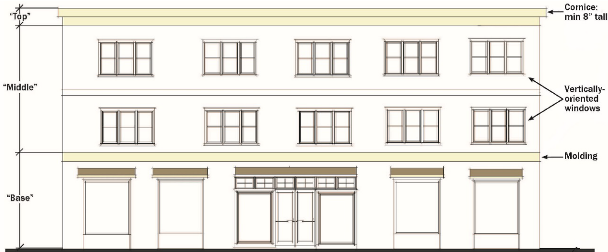
FIGURE 533-4 ARTICULATION

This standard applies to building ground floors on primary streets.