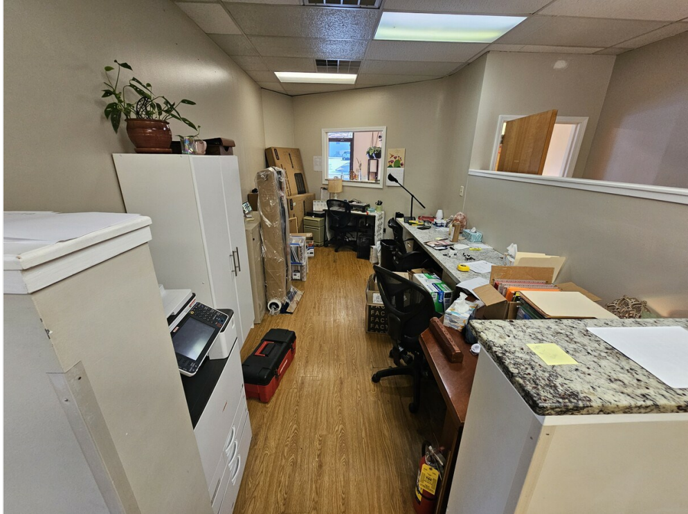
Work Stations / Reception