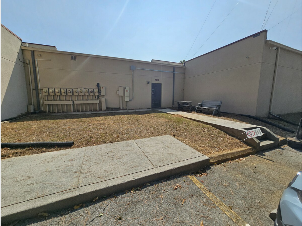
Ample outdoor lunch seating area