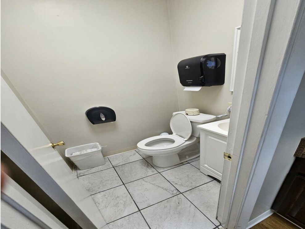
Employee Bathroom #2