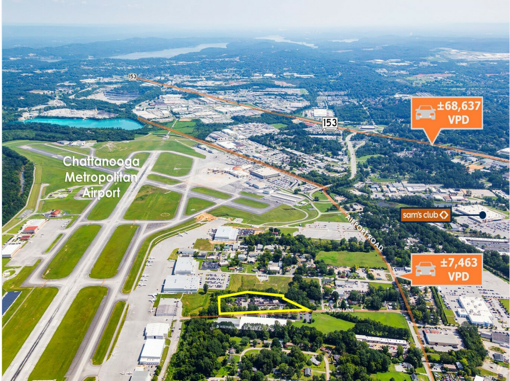
Aerial - VPD