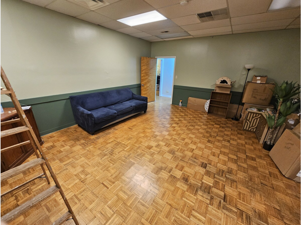
Conference Room / Yoga/Martial Arts