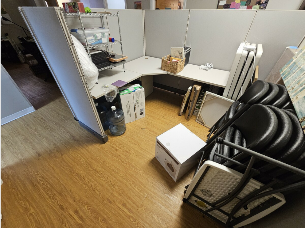
Work Station - Cubicle