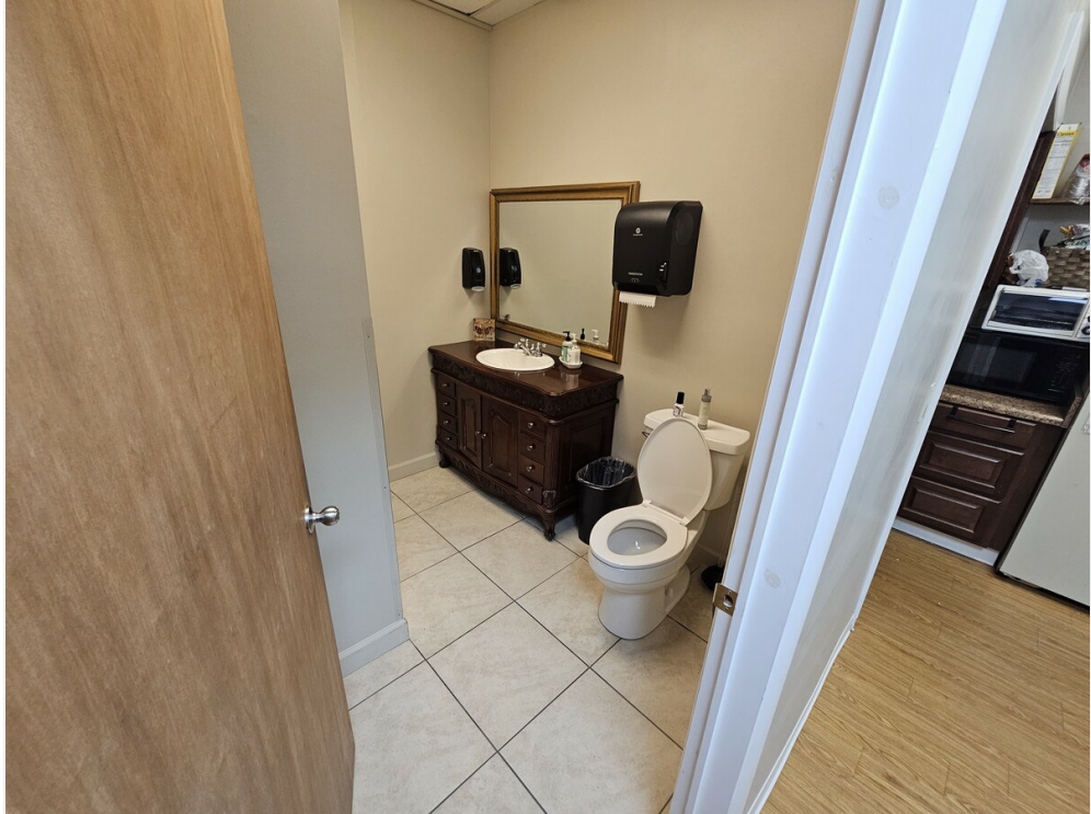
Client / Guest Bathroom