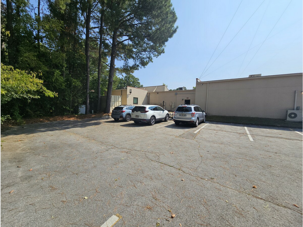
Parking in Rear