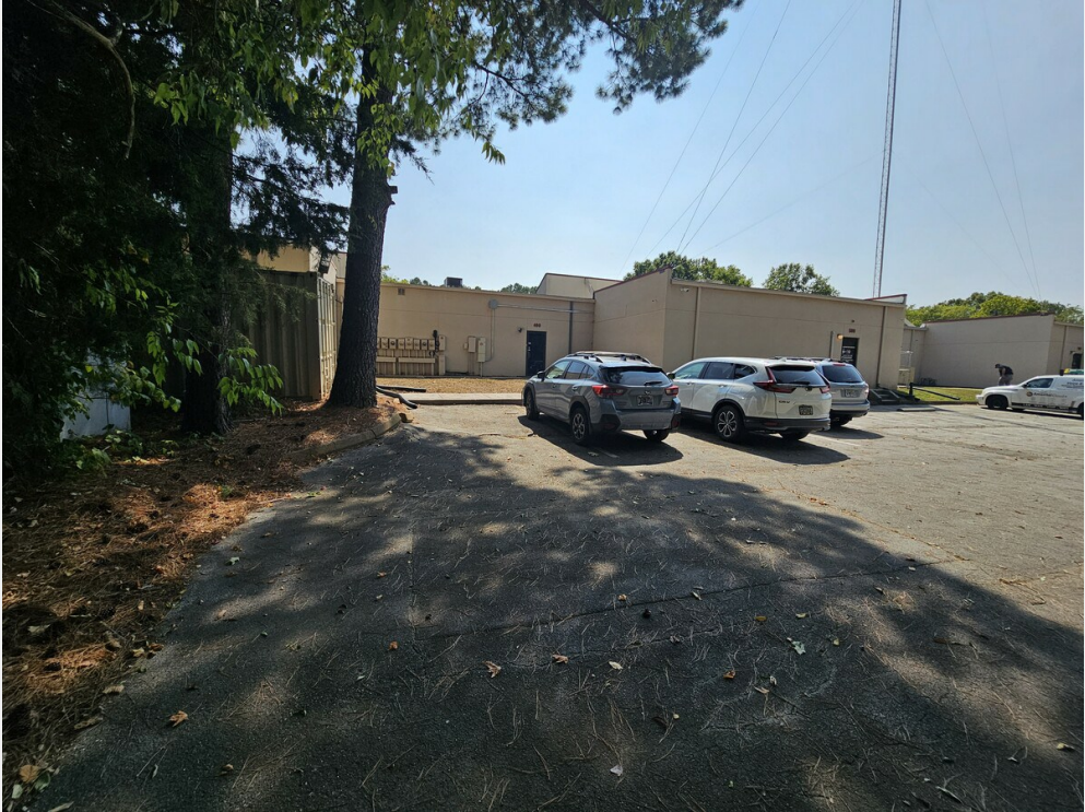
Parking in rear