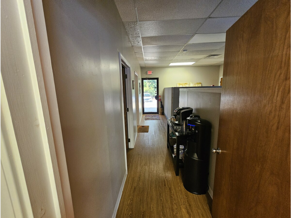
Hallway to Rear Entrance