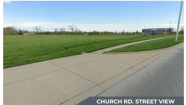
CHURCH RD. STREET VIEW

MATT KNAFEL 317.385.9808 mknafel@kwilladvisors.com