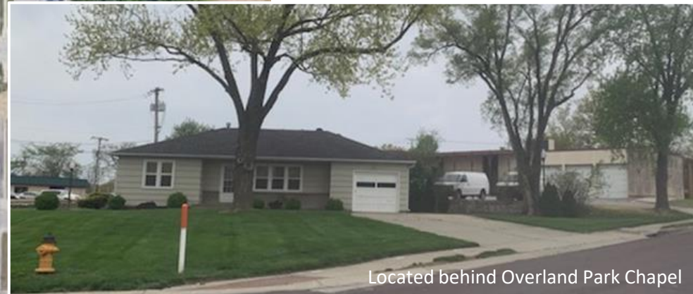
Located behind Overland Park Chapel