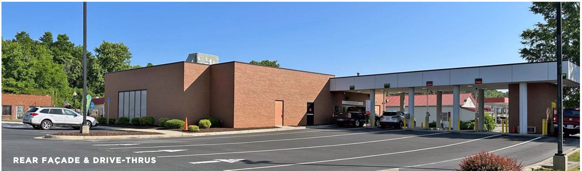
REAR FAÇADE & DRIVE-THRUS