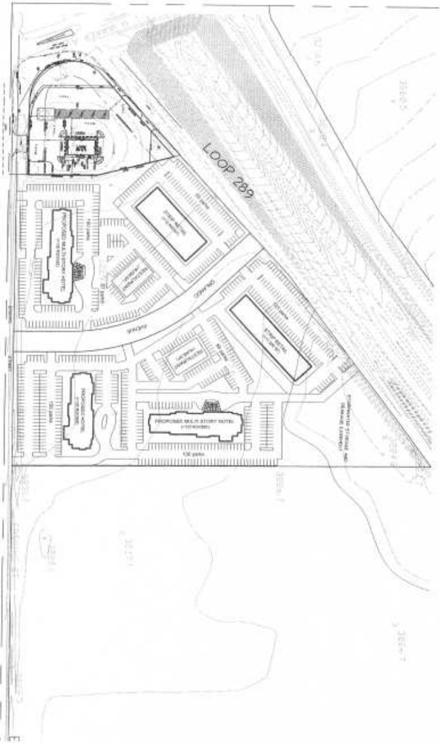
HOTEL STUDY PLAN - SECTION 18, BLOCK A - OPTION 2