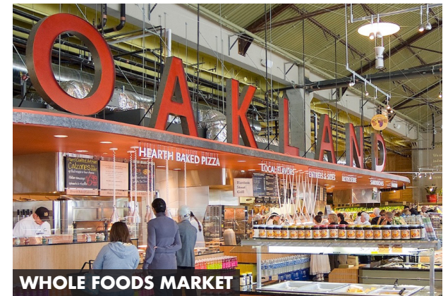
WHOLE FOODS MARKET