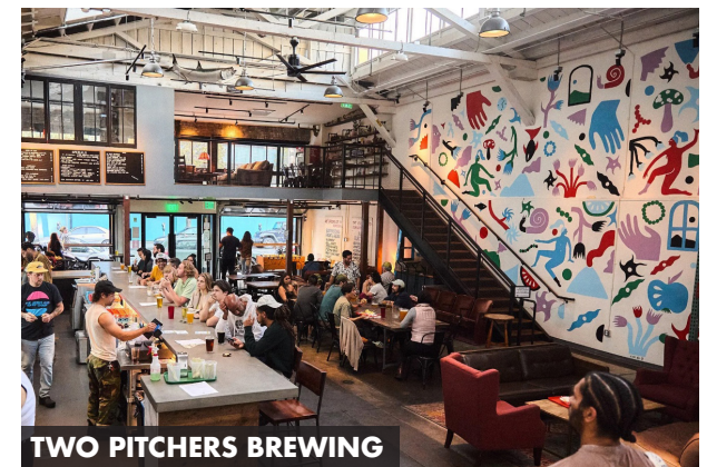
TWO PITCHERS BREWING