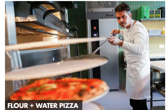
FLOUR + WATER PIZZA