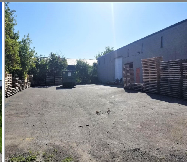
REAR SHIPPING YARD VIEW