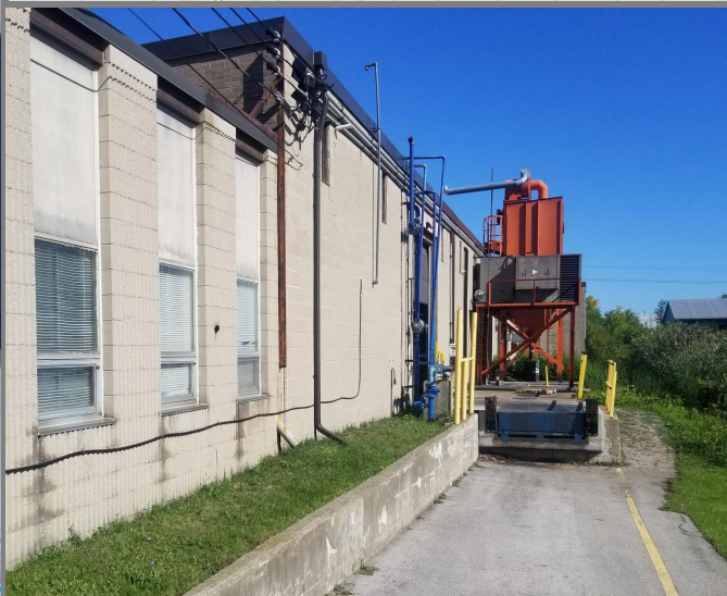
TRUCK LEVEL LOADING PLATFORM