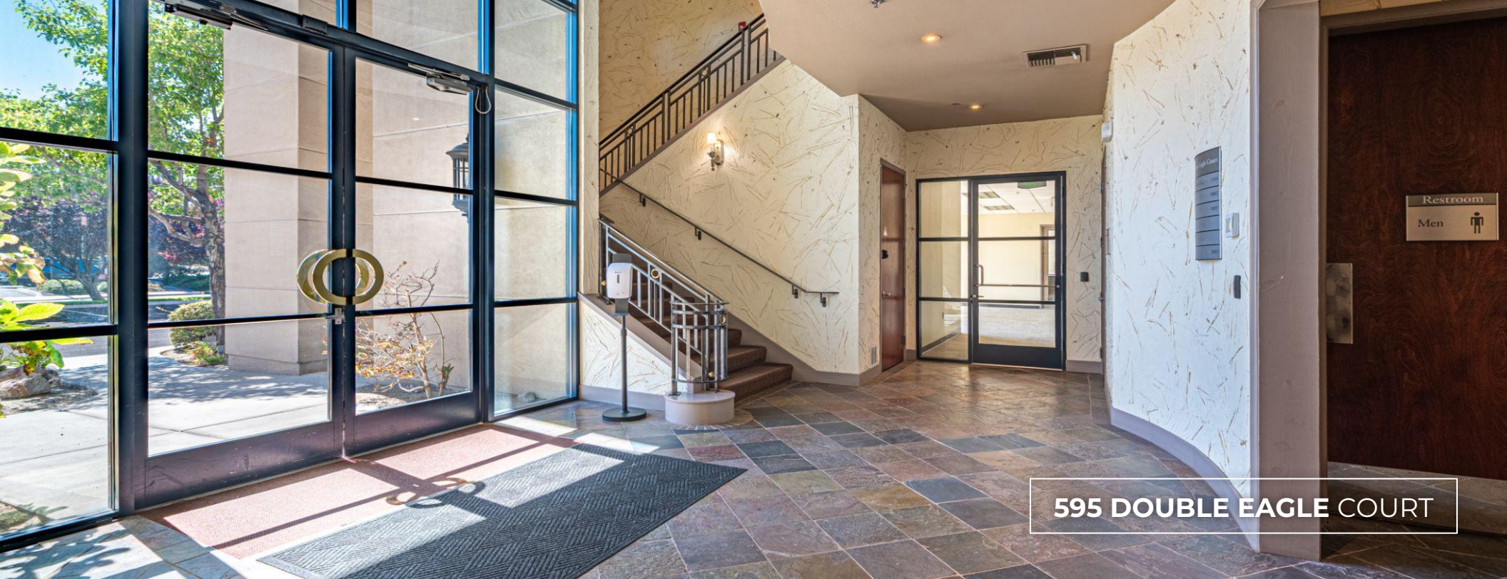
595 DOUBLE EAGLE COURT