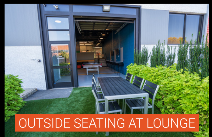
OUTSIDE SEATING AT LOUNGE