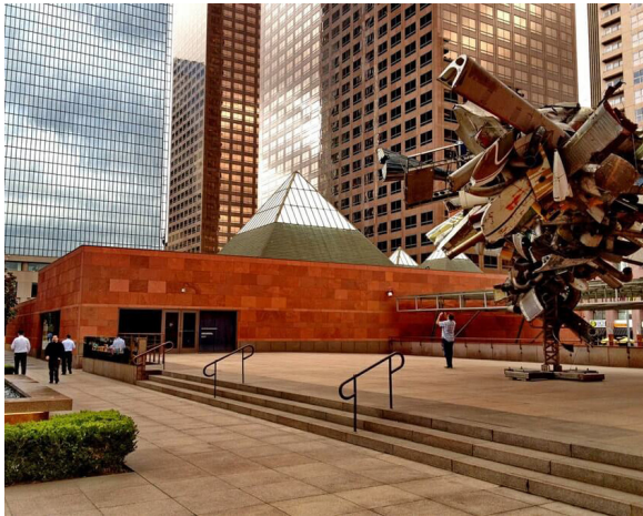
📍 MOCA MUSEUM