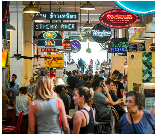
📍 GRAND CENTRAL MARKET