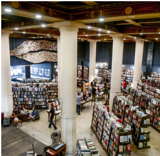
📍 LAST BOOKSTORE