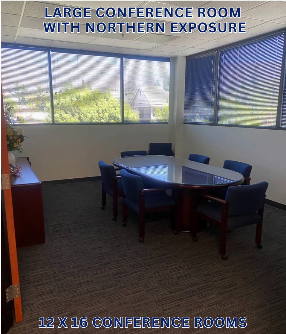
LARGE CONFERENCE ROOM WITH NORTHERN EXPOSURE