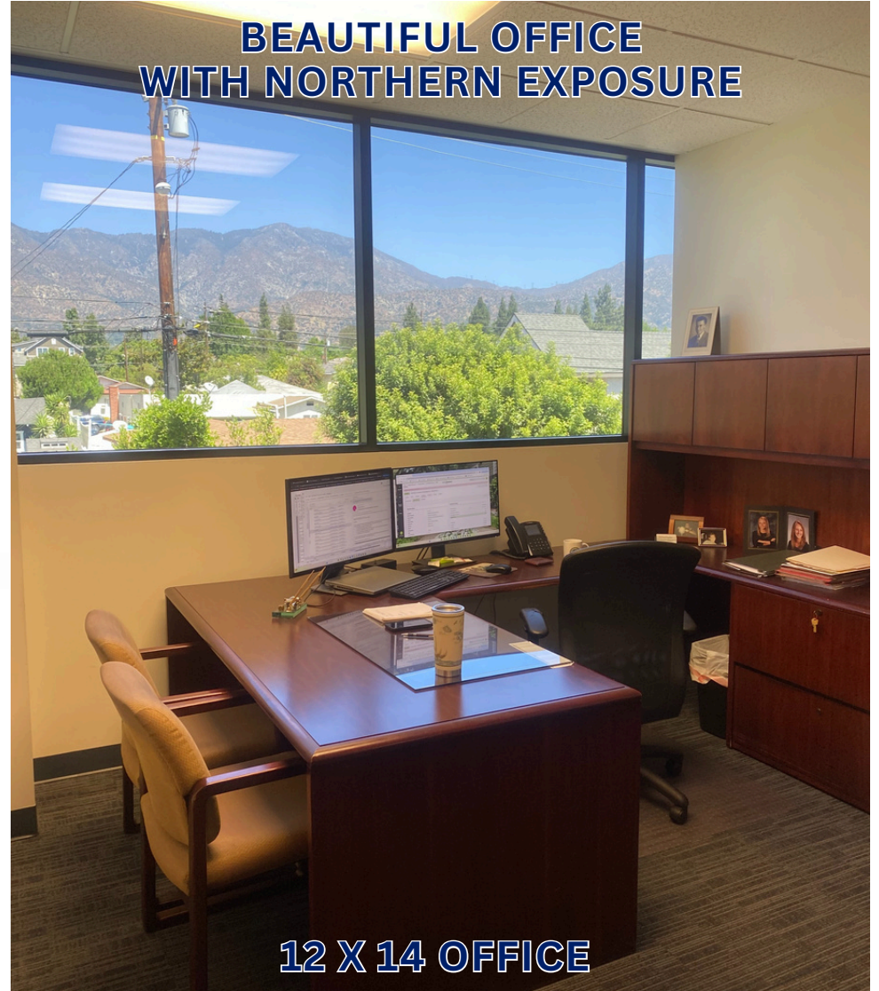
BEAUTIFUL OFFICE WITH NORTHERN EXPOSURE