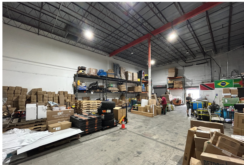
#1526 - 24' Clear Warehouse