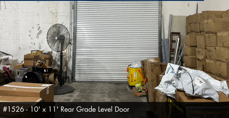
#1526 - 10' x 11' Rear Grade Level Door