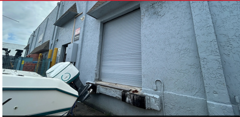
#1526 - 8' x 10' Dock High Loading Door