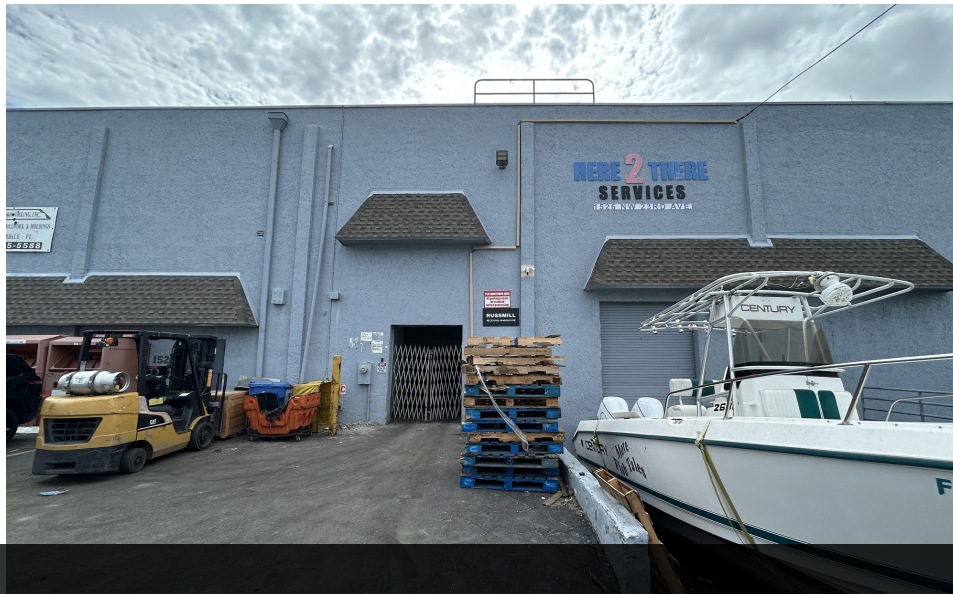
#1526 - Front