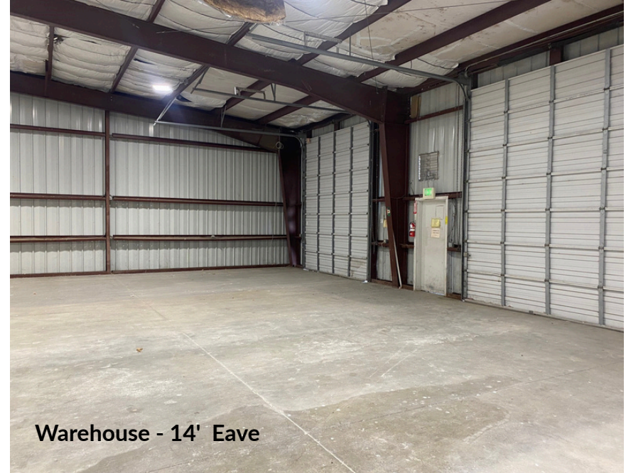
Warehouse - 14' Eave