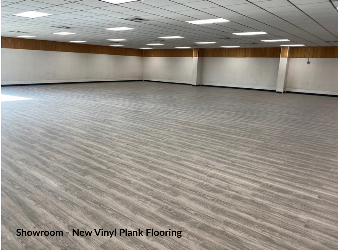
Showroom - New Vinyl Plank Flooring