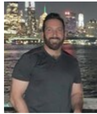
Paul Shabo Pappas Plaza

1814-1936 US Highway 19, Holiday, FL 34691