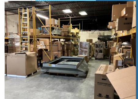
7632 1200 sf Office 2640 sf Warehouse