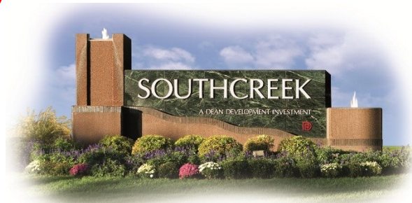
Building III—7201 W. 129th St.

Available 2nd Quarter 2024 Terrific Small Suite on 1st Floor Move-In Ready Easy Access to Major Highways Walk to Restaurants and Shops