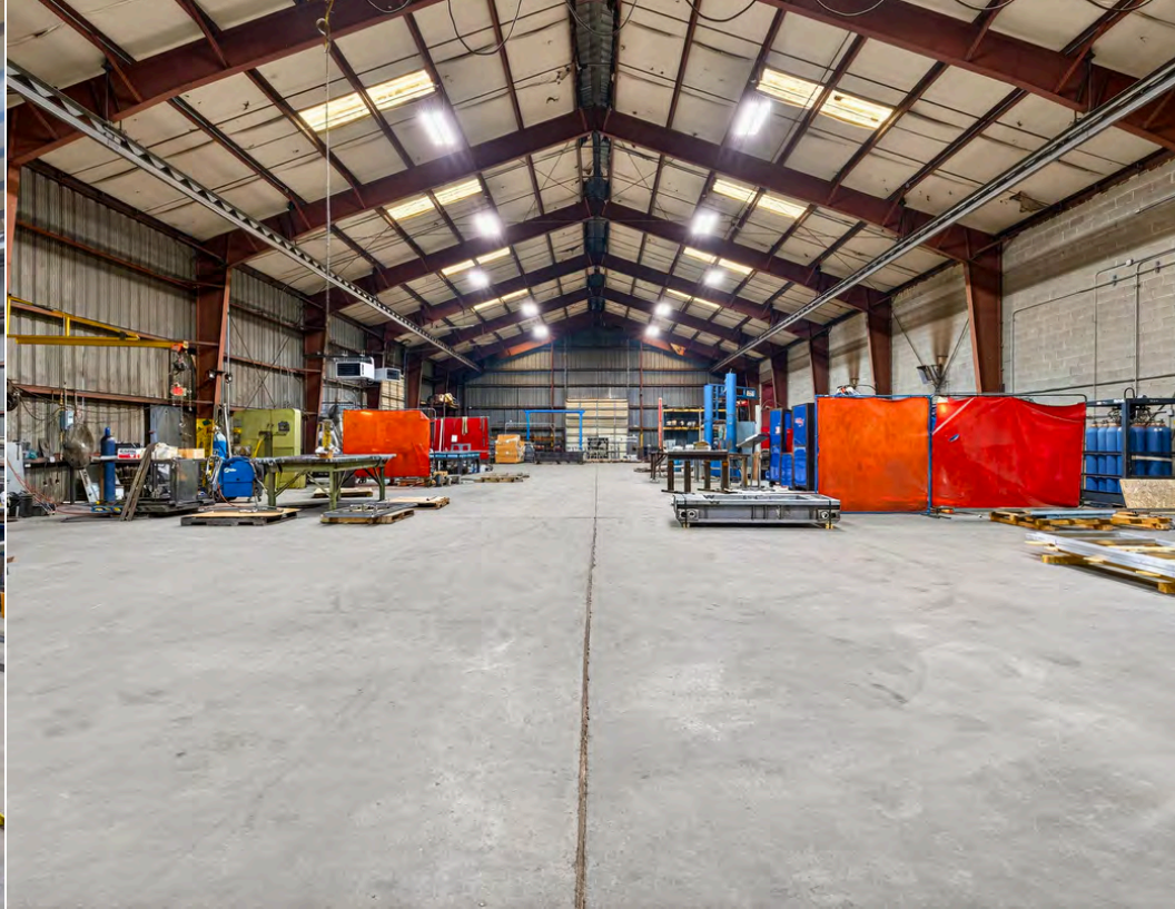
20 Crigler Property Photos