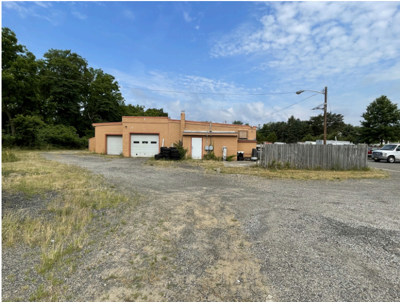
BACK OF BUILDING WITH 2 BAYS