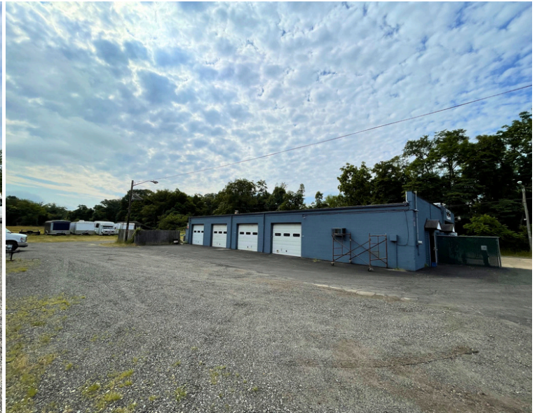
SIDE VIEW WITH 4 BAYS

The foregoing information was furnished to us by sources which we deem to be reliable, but no warranty or representation is made as to the accuracy thereof. Subject to correction of errors, omissions, change of price, prior sale or withdrawal from market without notice.