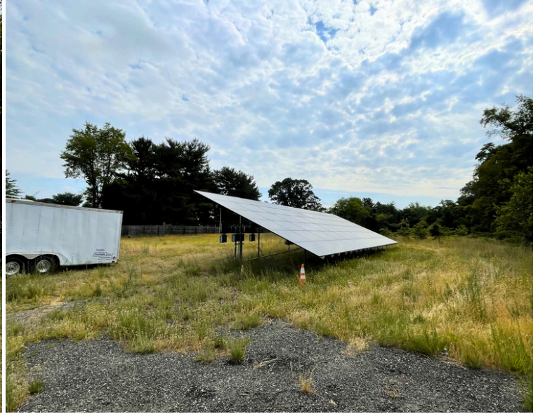
SINGLE SOLAR PANEL